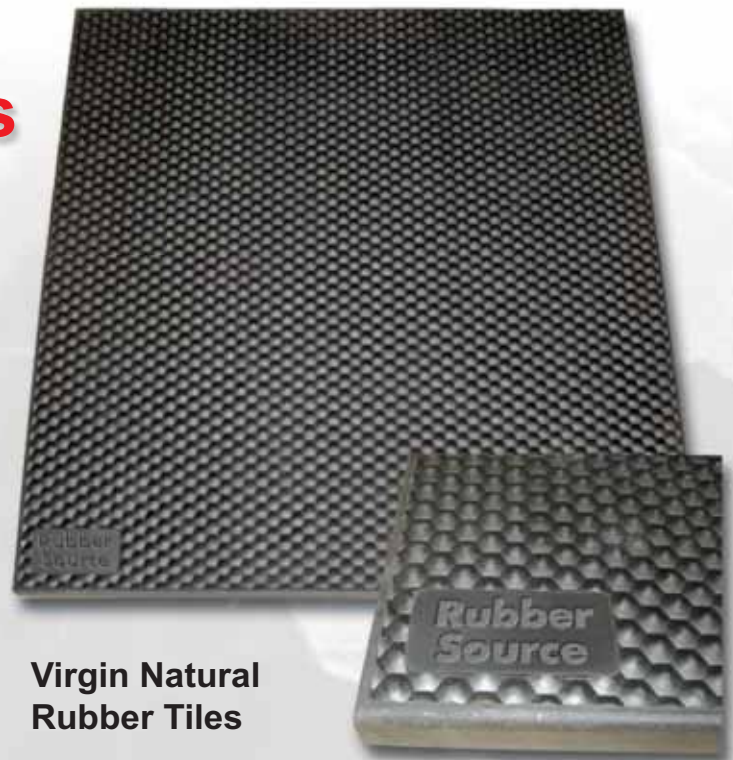
Virgin Natural Rubber Tiles

The tiles measure 2 ft. x 2 ft. and range in thickness of 1", 1-1/2" and 2". Colors available include black, red and green.